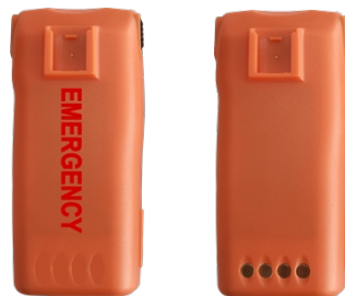
Battery Emergency / Rechargeable